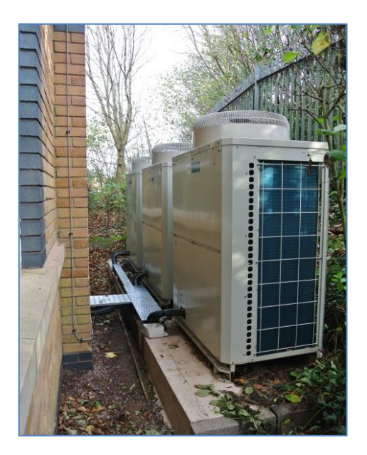
Hybrid VRF provides the same 2-pipe flexibility of traditional VRF, whilst delivering 4-pipe Chiller levels of comfort for occupants.