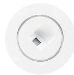
3D i-see Sensor (comes with the grille)