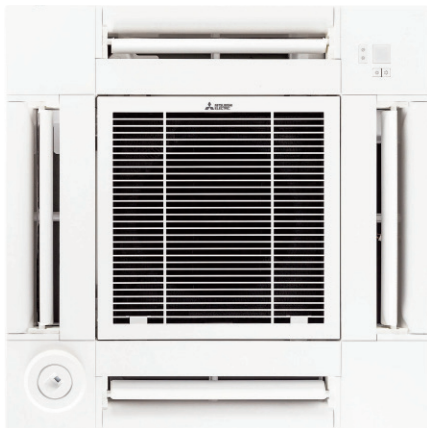
Ceiling Cassette Slim-line 600 x 600 (4-way blow)