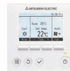
PAR-32MAA Wired Remote Controller