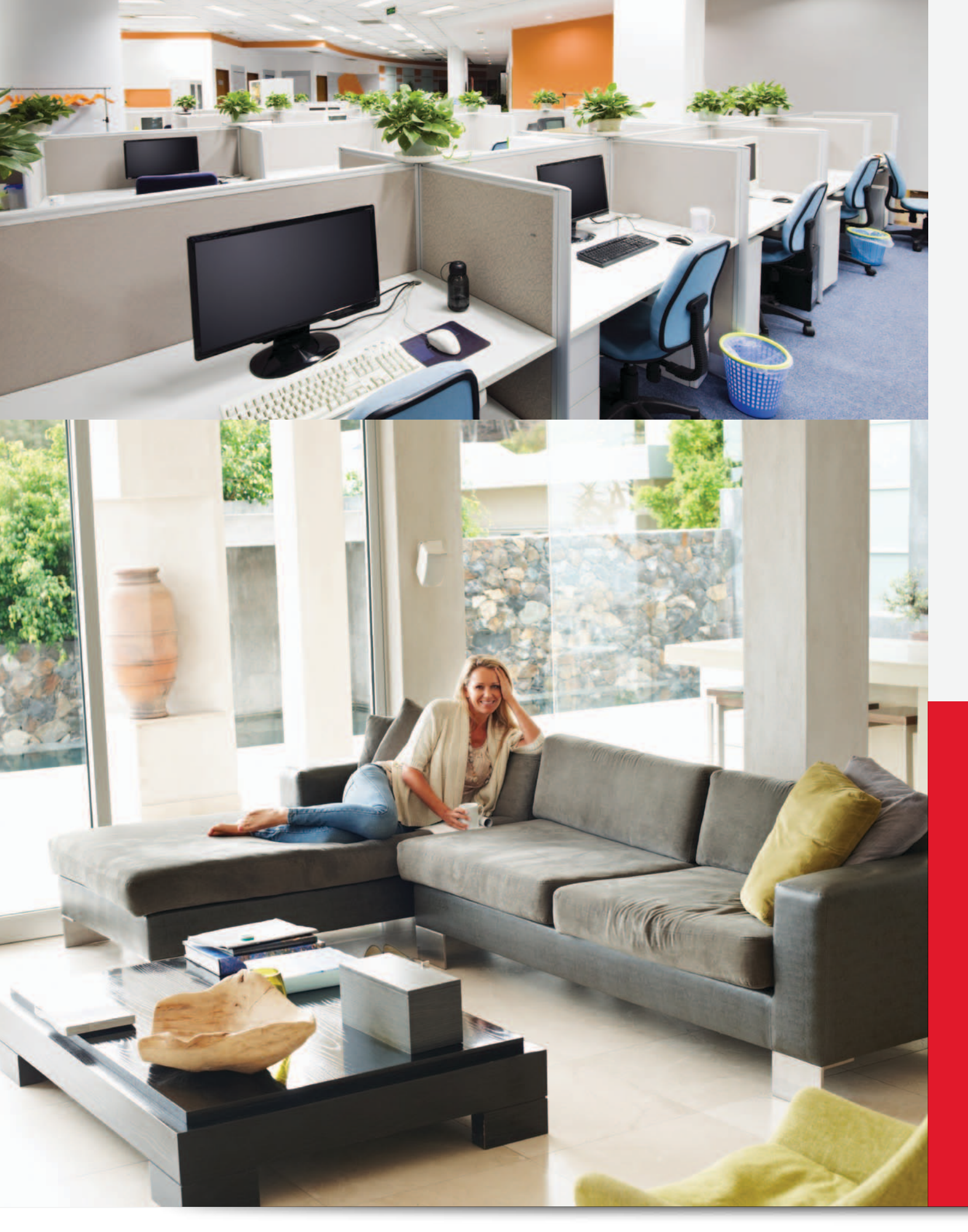
Mitsubishi Electric Information Guide – Ventilation and indoor air quality – ISSUE 38