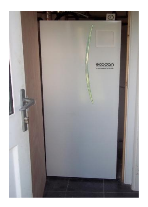
The 200 litre stainless steel cylinder comes pre-wired and pre-plumbed for ease of installation.