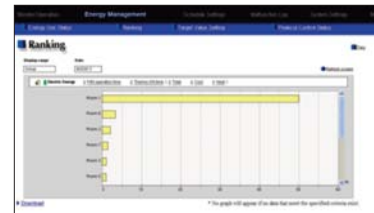
Indoor Unit Energy Consumption Ranking Webpage