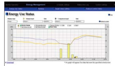
Energy Use Webpage