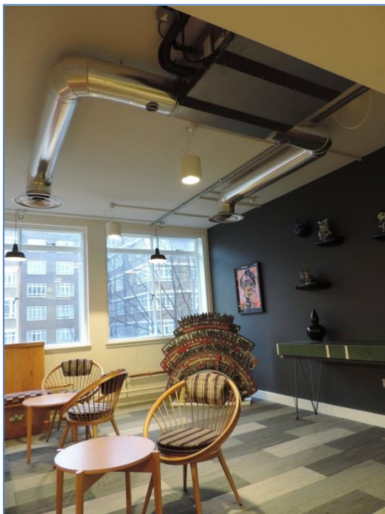
BELOW: All of the building services are on show including this Lossnay heat recovery ventilation unit.

There are 22 separate meeting spaces of varying sizes spread across the three levels plus breakout and coffee areas. They have all been given a thoroughly modern overhaul and, in keeping with the theme, the air conditioning services are all on show, with ductwork runs and vents all part of the look and feel of the latest offering from venue hire company, etc Venues.