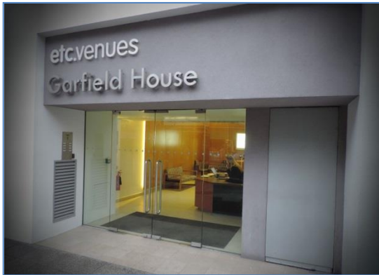
ABOVE: Garfield House is the latest distinct, modern offering from etc Venues.