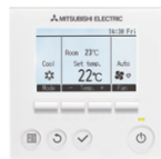
PAR-31MAA Wired Remote Controller (Optional)