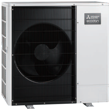
11.2kW Ecodan unit

The Renewable Solutions Provider Making a World of Difference