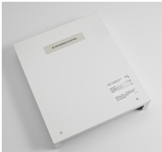
Flow Temperature Controller 3 (FTC3)

The FTC3 incorporates an intelligent operating system which uses a series of sensors to monitor the temperature inside and outside the home. These sensors constantly talk to each other and tell the system when it needs to adjust the output from the air source heat pump to compensate for outside conditions.